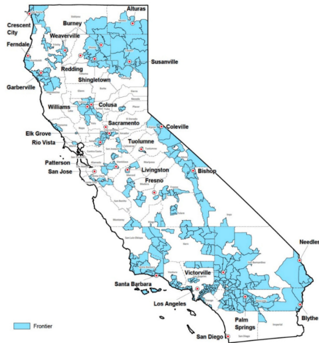
Figure 1: Frontier Service Territory

As of 2024, Frontier reported to the Commission that it had a total of approximately 314,000 working lines for traditional telephone service companies. The number of working lines has declined from about 1,558,456 in 2016 (See Figure 2).