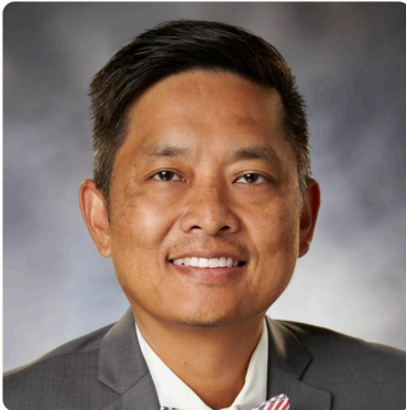
City of Cerritos