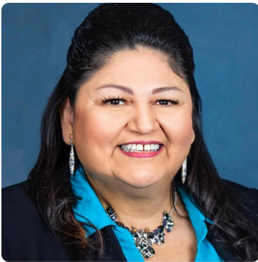
City of Long Beach