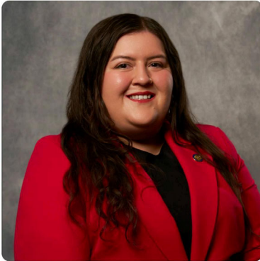
City of Cudahy