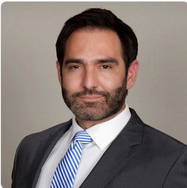
City of Pico Rivera

The Honorable Councilman was elected to the Pico Rivera City Council in November 2020 and re-elected in 2024. He proudly served as Mayor in 2023 and is current chairman of the Pico Rivera Community Safety Ad Hoc Committee, a representative for the Pico Rivera Chamber of Commerce, and the Pico Rivera Christmas Baskets.