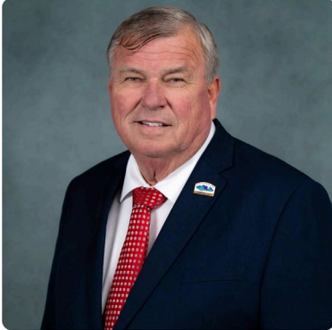
City of Bellflower