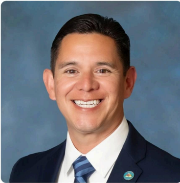
City of Lakewood