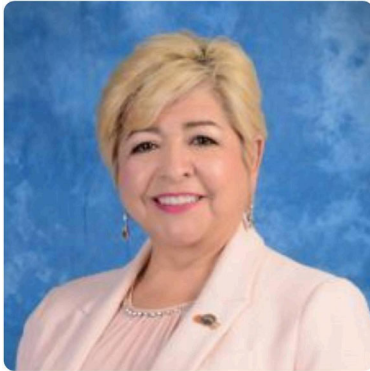
City of South Gate