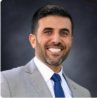
City of Bell