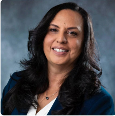
City of Montebello