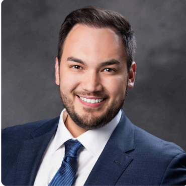
City of Downey