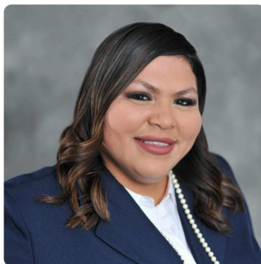
City of Bell Gardens