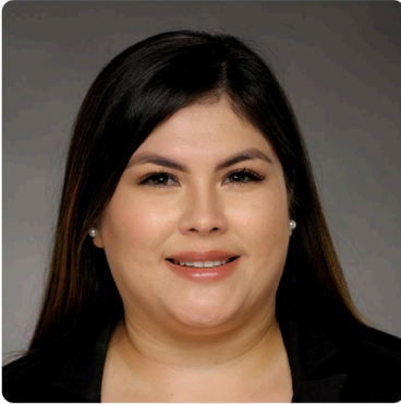
City of Vernon