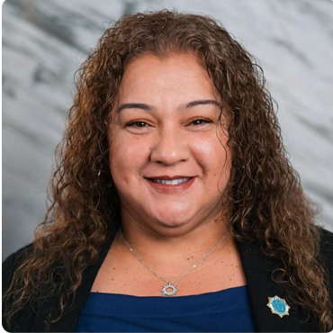
City of Lynwood