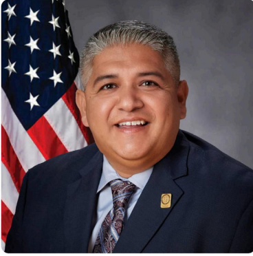
City of Santa Fe Springs