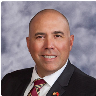
City of La Mirada