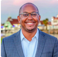
City of Long Beach