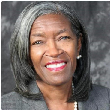
City of Compton

In 2015, Mayor Sharif ran a successful campaign for Compton City Council District 4. As a councilmember, she enhanced the city's scholarship program, supported the Collaborative Court, coordinated efforts to address human trafficking, and led initiatives to tackle homelessness. She also coordinated the redevelopment of South Park and served on several regional and statewide committees.