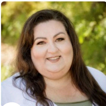
City of Avalon