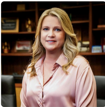
City of Industry