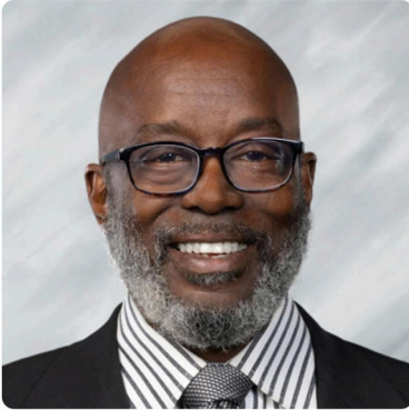
Port of Long Beach