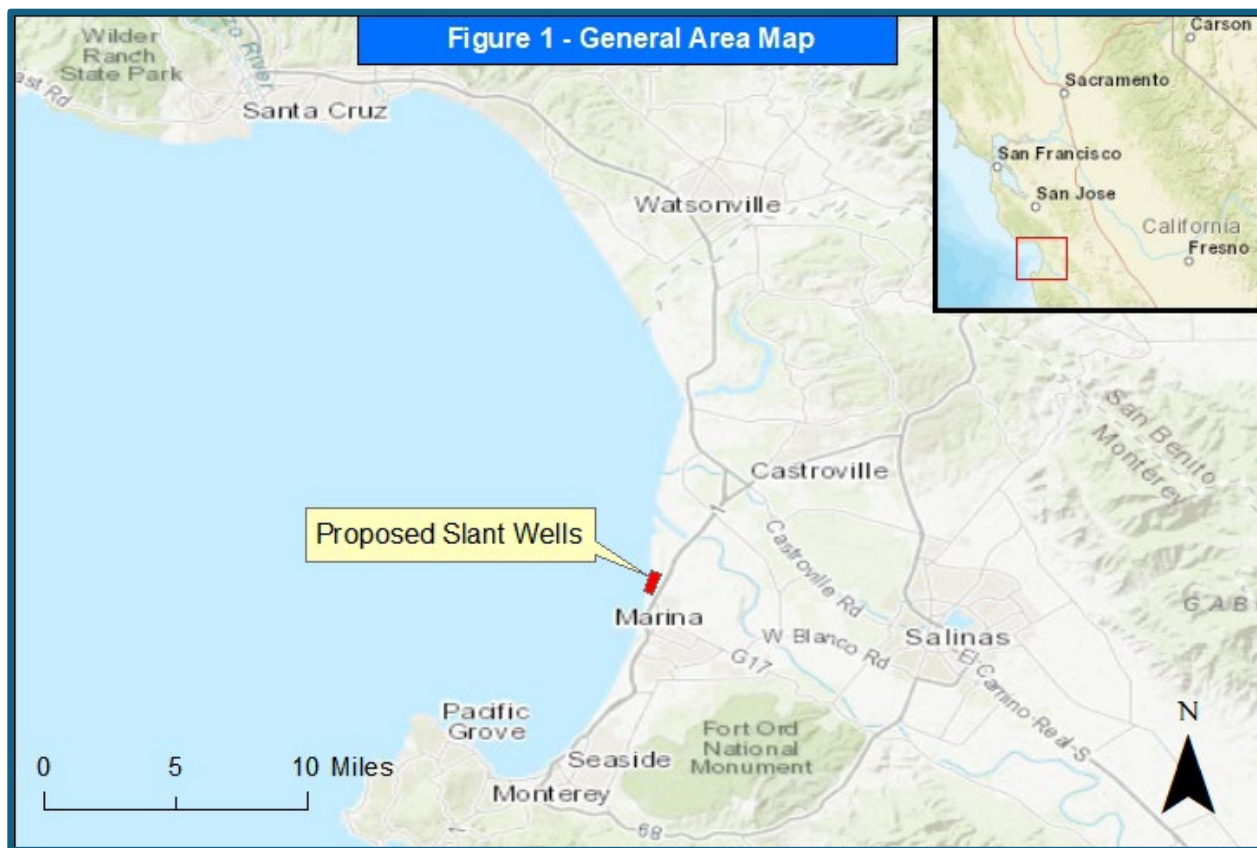
Figure 1 – General Area Map

California-American Water Company (Cal-Am) proposed the Monterey Peninsula Water Supply Project (MPWSP or proposed project) as a desalination project that would draw water from slant wells drilled from a location near the shoreline of the Pacific Ocean within the City of Marina (Marina or City), in Monterey County, beneath Monterey Bay. (See Figure 1 – General Area Map.)