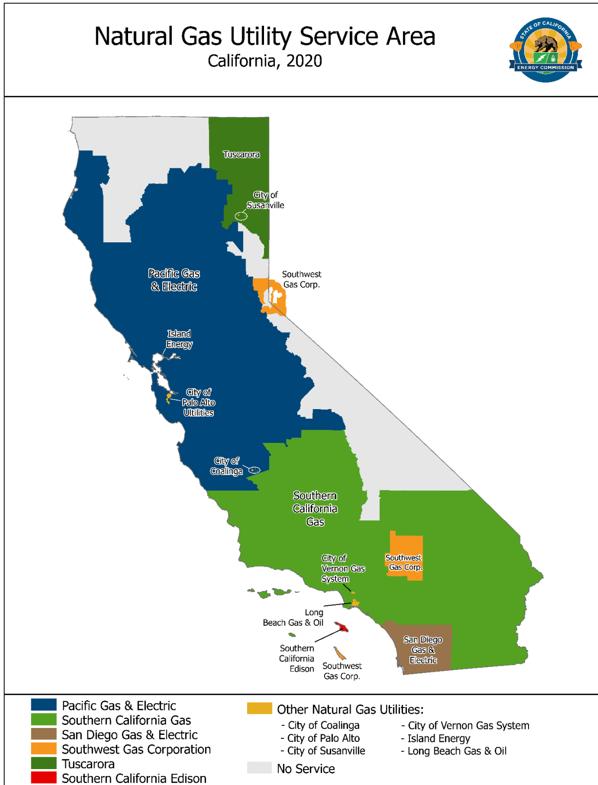
Figure 2.1: Eligible Natural Gas Utility Service Area (California, 2020)