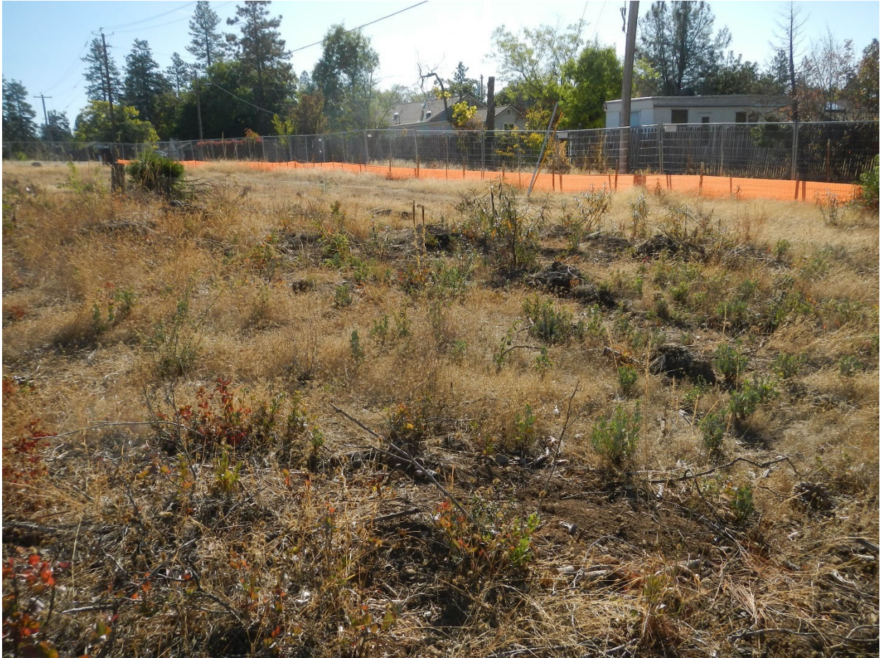
Photo 8: Significant growth of small native shrubs is present within the southern portion of the site, including but not limited to manzanita, yerba santa, poison oak, deerbrush, coffee berry, Pratten's buckwheat, honeysuckle, and evergreen buckthorn. Dried stalks of some herbaceous perennials such as soap plant ( Chlorogalum pomeridianum ) were noted in this area as well as resprouting oak stumps. October 3, 2023.