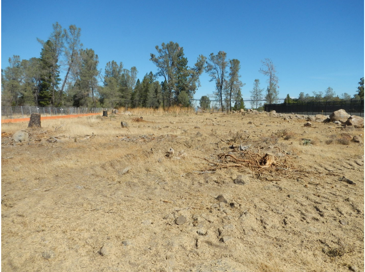
Photo 2: View from west-central portion of site (west of the LNG facility) facing north. Disturbance in this area was limited to vegetation removal and surficial soil disturbance from rubber-tired vehicles (note tracking and limited soil churning evident under the layer of BFM). October 3, 2023.