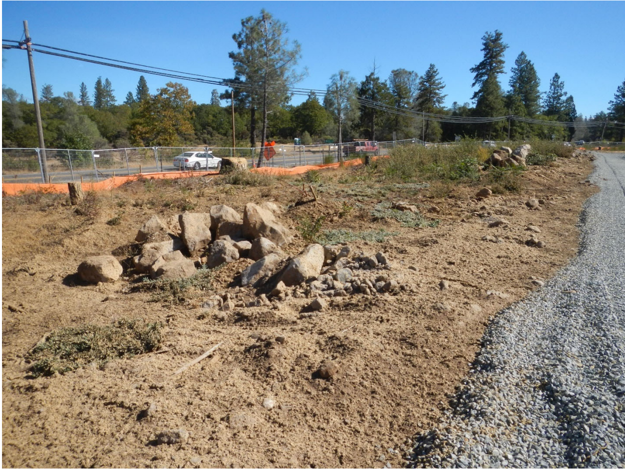
Photo 4: View from north-central portion of site facing east along northern boundary. Disturbance along this section ranges from vegetation removal with minor soil disturbance to substantial soil disturbance/grading. October 3, 2023.