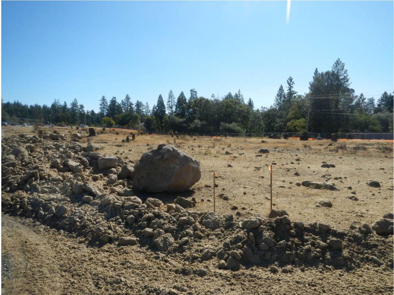
Photo 1: View from south-central portion of site (south of LNG facility) facing east. This photo depicts the condition of the southern portion of the site where vegetation was cleared, but soil disturbance was minimized to tire tracking/rutting in limited areas (beyond staking and rock piles). Surficial rocks and stumps indicate approximate limit of undisturbed soils. October 3, 2023.