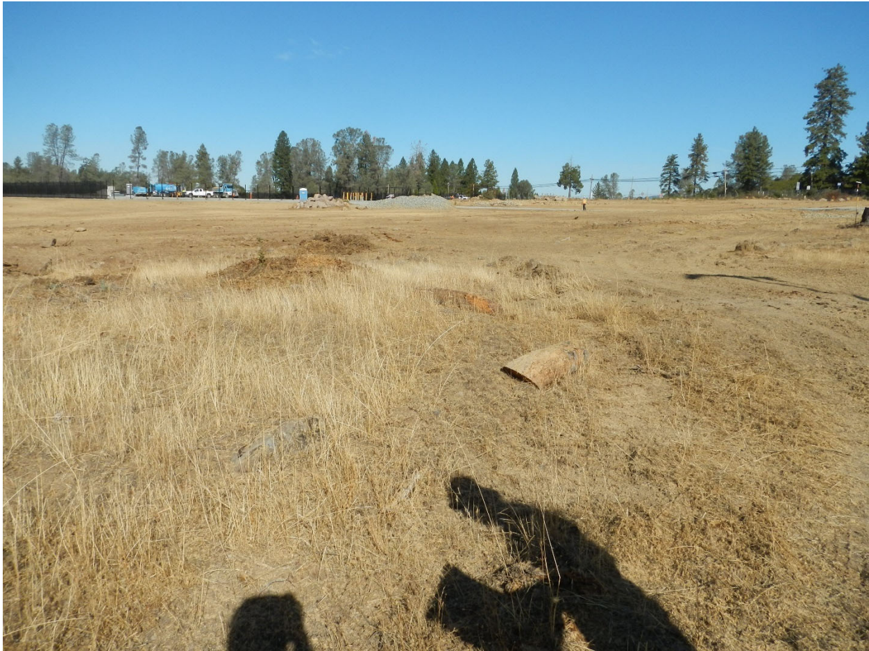
Photo 5: View from southeast corner of site facing northwest, across section of site cleared of vegetation with topsoil replacement. October 3, 2023.