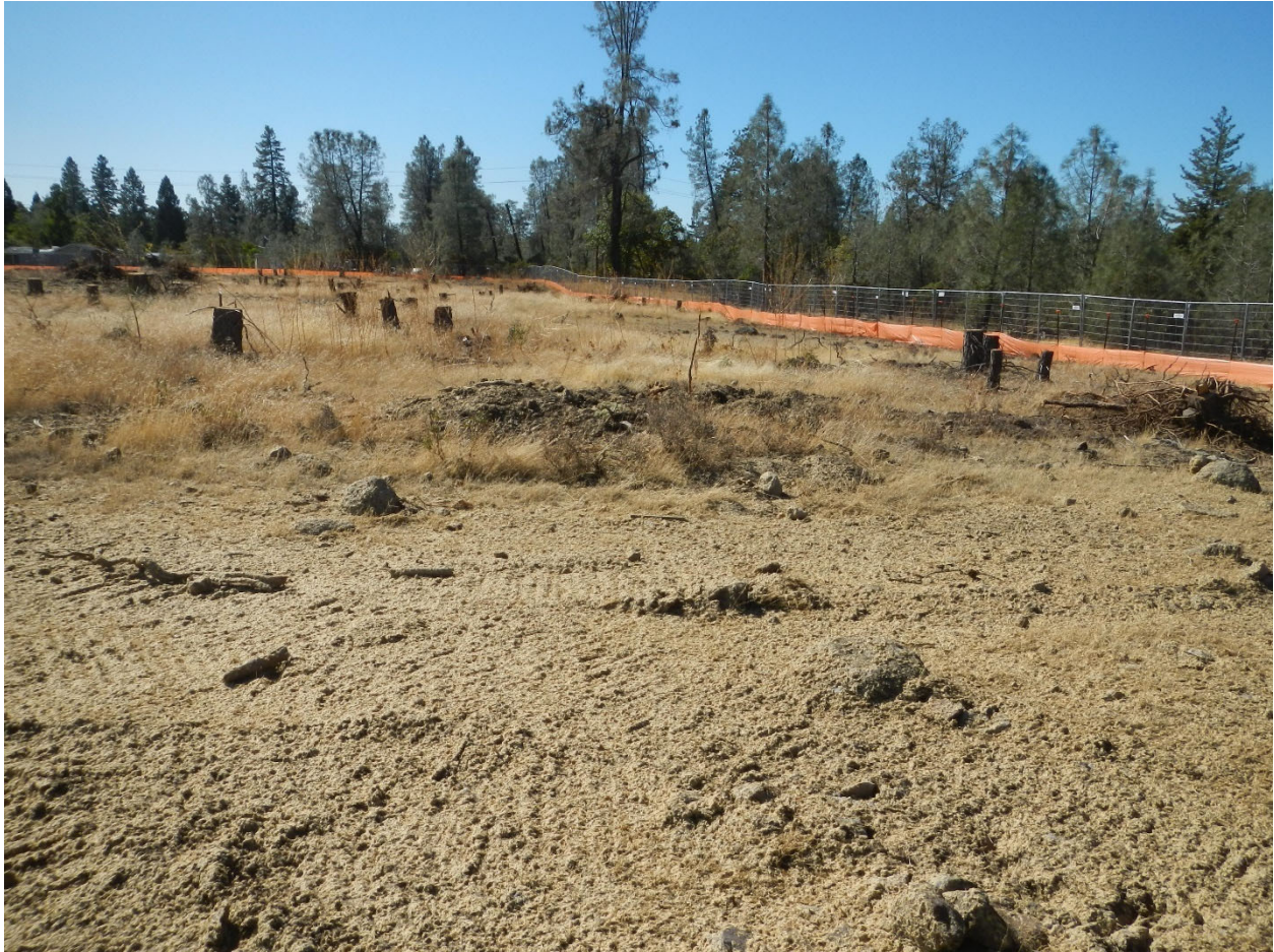
Photo 3: View from northwest corner of parcel facing south. Stump locations indicate areas where site disturbance was limited to vegetation removal and vehicular access, and the extent to which the BFM was applied. October 3, 2023.