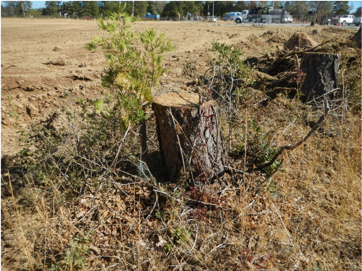
Photo 9: Southern portion of site at limit of soil disturbance. Woody species present in this representative photo include incense cedar ( Calocedrus decurrens ), poison oak, coffee berry, evergreen buckthorn, foothill pine ( Pinus sabiniana ), and oak. October 3, 2023.