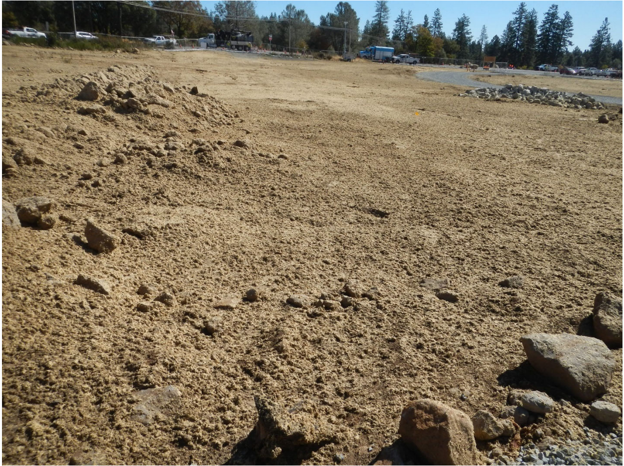
Photo 6: Northeast portion of site facing east. Vegetation was cleared in this area and topsoil has been mixed with subsoil material. October 3, 2023.