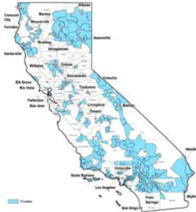
Figure 1: Frontier Service Territory

As of 2024, Frontier reported to the Commission that it had a total of approximately 314,000 working lines for traditional telephone service companies. The number of working lines has declined from about 1,558,456 in 2016 (See Figure 2).