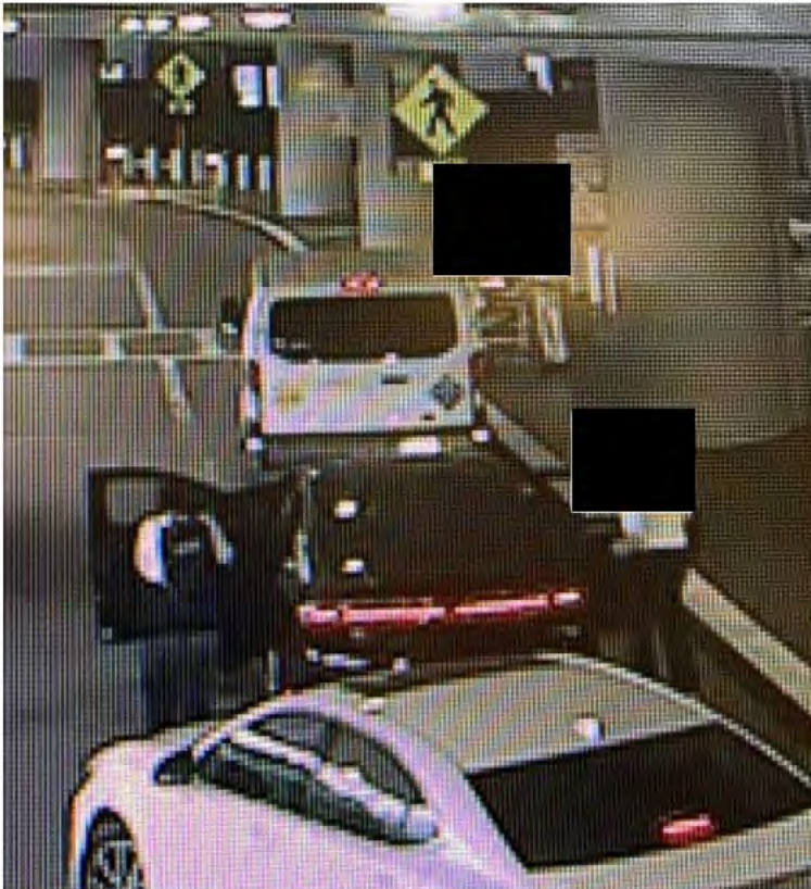
The 2 passengers both get in the back seat (also very not family-like).