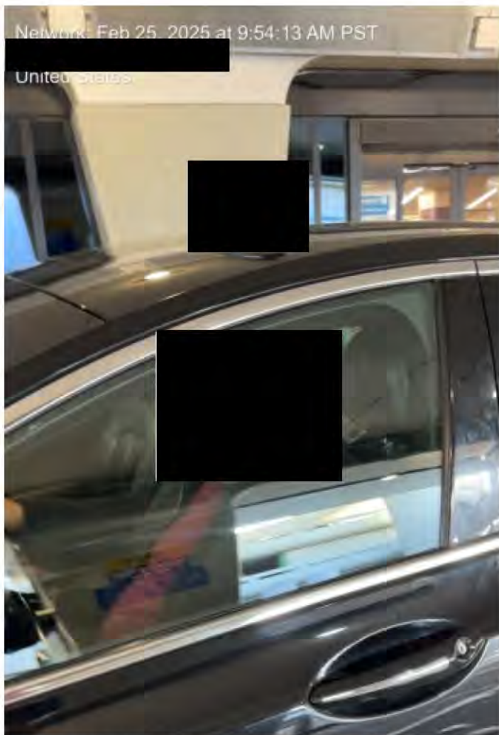
Mr. Rashed leaving with the passenger (she was in the rear seat).

The mentioned admin citation and notice to cease & desist was sent to him via email (please see attached email).